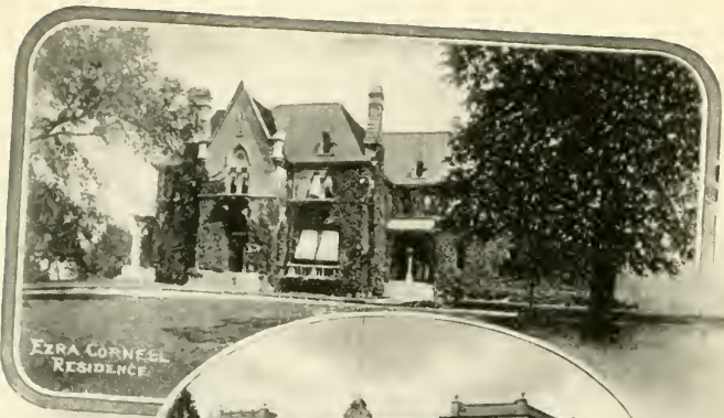
EXRA CORNELL RESIDENCE